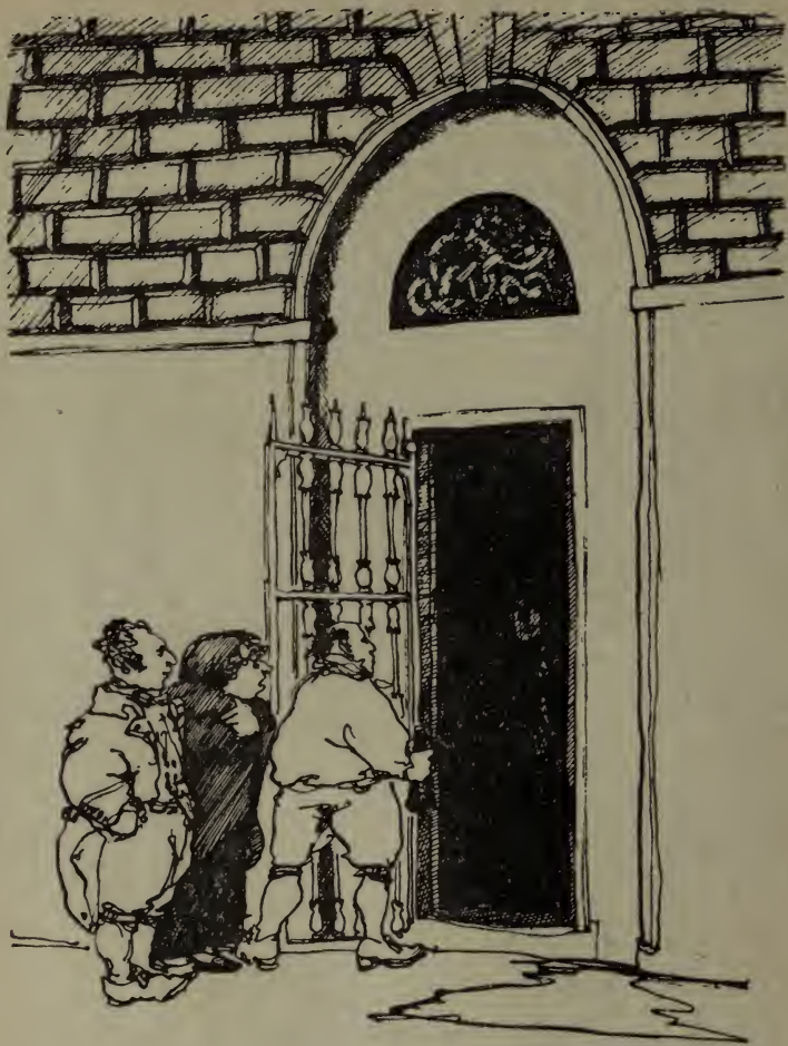
One of Hector McDonnell's illustrations to "The Night Before Larry Was Stretched" , with an introduction by Terence de Vere White (Blackstaff Press, gift edition of 500 signed copies, £15 in UK.)